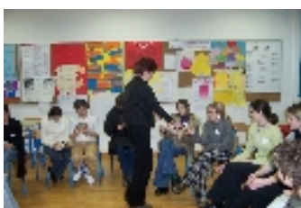
Workshop: trafficking in persons, Delfin, Pakrac, May 2004

Our work in the year 2004 was supported by: Kvinna till Kvinna, World Day of Prayer, World Learning, Mama Cash, OSCE for ACTA, Zagrebačka Banka, Open Society Institute Zagreb, Care International.