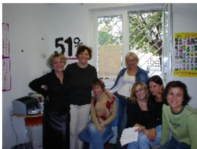
Workshop: Women's sexuality, Domine, Split, October 2004.

(20 million HRK from the state, Jutarnji List, 26.02.2004)